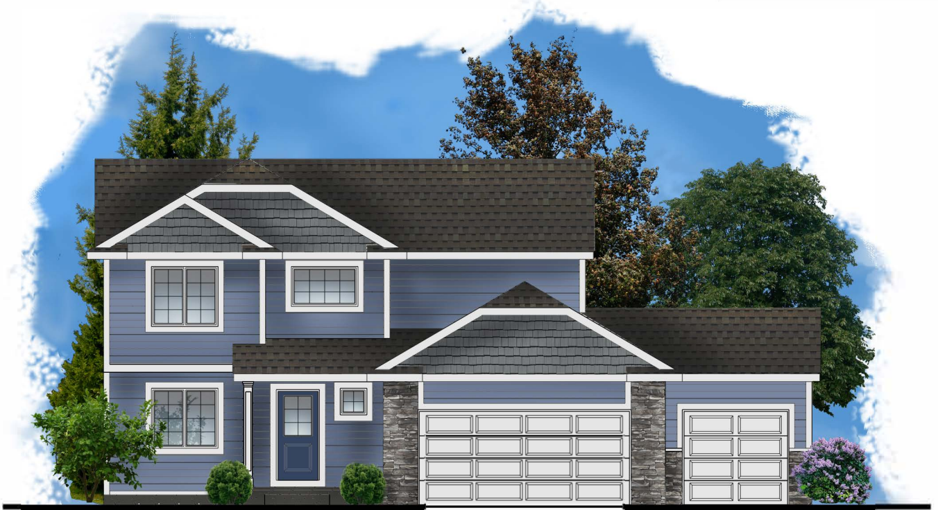
Renderings are artist's conception only. Some optional features may be shown.